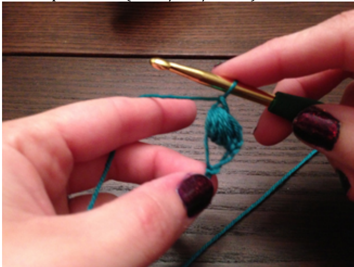
(7Puff into 4 th ch from hook)

Row 2: Puff stitch (7Puff) into the 4 th chain from hook. Ch1, sk1 ch, 8Puff/ch1 into next ch. Continue the pattern of (8Puff/ch1/sk1ch) until end of row. Ch3, turn.