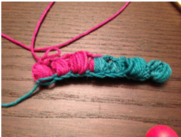
(Row #2 Complete)

Row3: 7Puff into top of first stitch, then 8puff into ch1-sp after first st. Continue down the row, 8Puff in each space. (This is the “going downwards row”) After last space, ch3 and turn.