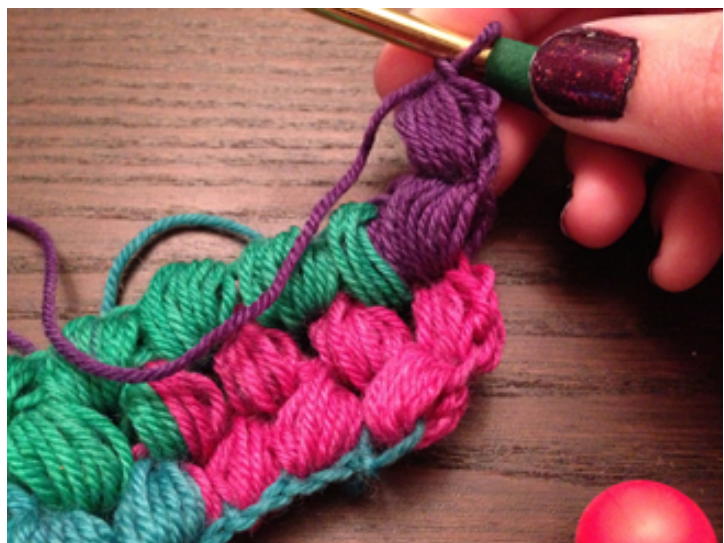
Starting Row 5 (aka row 3), ch 3, 7Puff into top of first st)