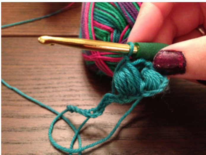
(Chain 1, skipped one chain, 8Puff/Ch1 in next st)