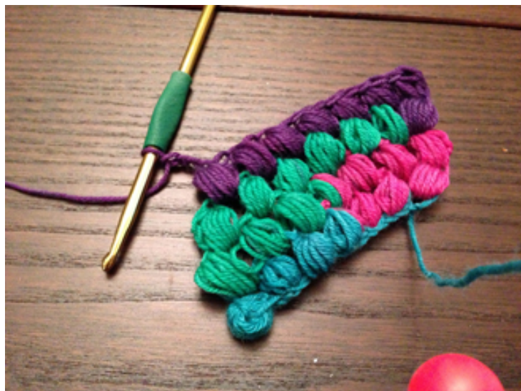
Row 5 complete