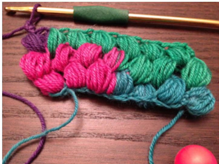
(Row 4 complete)