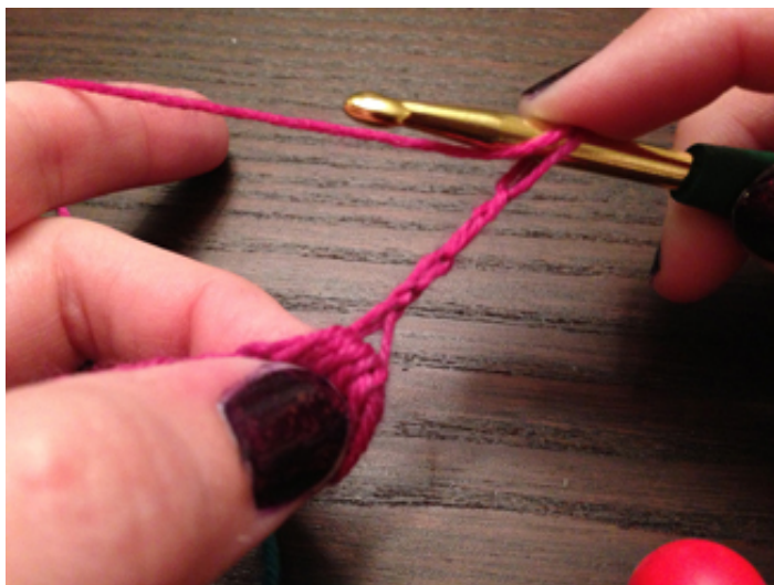
(ch3, then 7Puff into top of 1 st st)

Row3: 7Puff into top of first stitch, then 8puff into ch1-sp after first st. Continue down the row, 8Puff in each space. (This is the “going downwards row”) After last space, ch3 and turn.